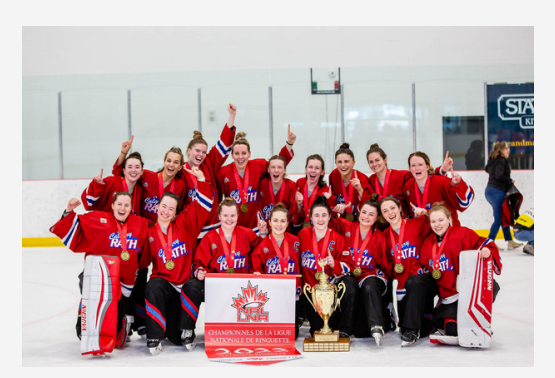
NRL Champions - Calgary RATH